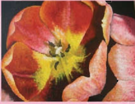
September: Kathe Suddendorf "The Odyssey of Art"

Artist's Reception: Friday, September 9, 7-9pm