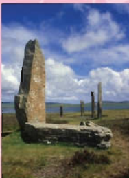
November/December: Photography by Cheryl Hogue

My Favorite Café is located in downtown Saline at 101 S. Ann Arbor St. Café hours: Mon-Th 7 am - 9:30 pm, Fri 7am-10pm, Sat 8am-10pm, Sun 8am-7pm