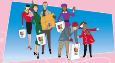
December: Two Twelve Arts Center Holiday Sale Saturday, December 10-Saturday, December 17, 10am-6pm (Closed on Sunday, December 11) Holiday Sale Opening Reception: Friday, December 9, 7-9pm