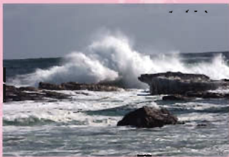
September/October: Photography by Lynn Quick

Sponsored by Two Twelve Arts Center and My Favorite Café